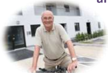
Assisted Technology - Great North Haven Louth