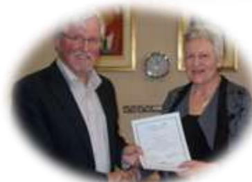
Ageing with Confidence