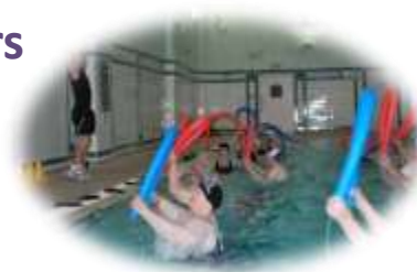
Recreation and Sports Partnership Kilkenny