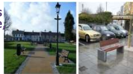
Parlours Initiative Louth