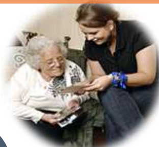
Remaining at Home