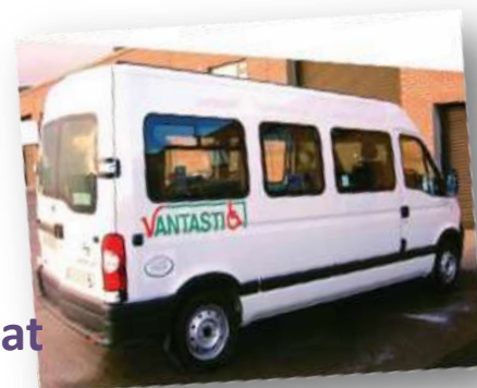
Getting about in Wexford