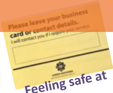
Feeling safe at Home